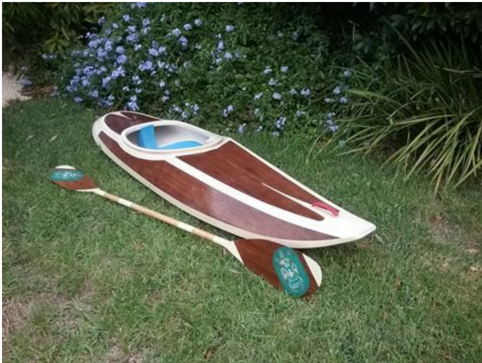
Andy's Matunuck Surf Kayak

Below we have some pictures that you have sent in during various stages of kit construction. We are always thrilled to see your project during any phase of construction, so please send us in your pictures so that we may publish them in future newsletters for everyone to enjoy.