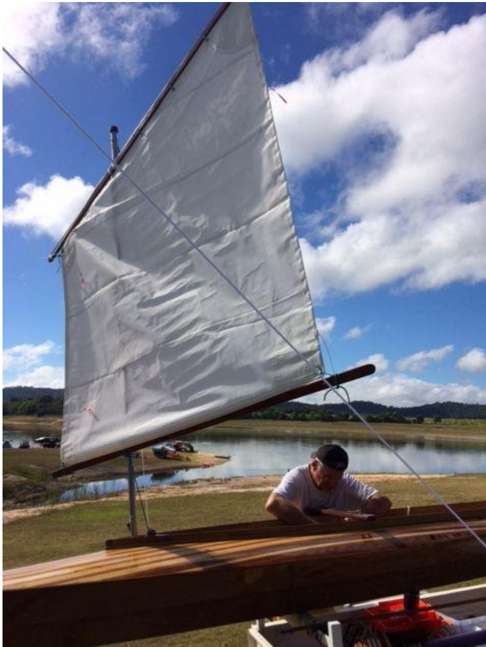
Tom's Mill Creek 16.5