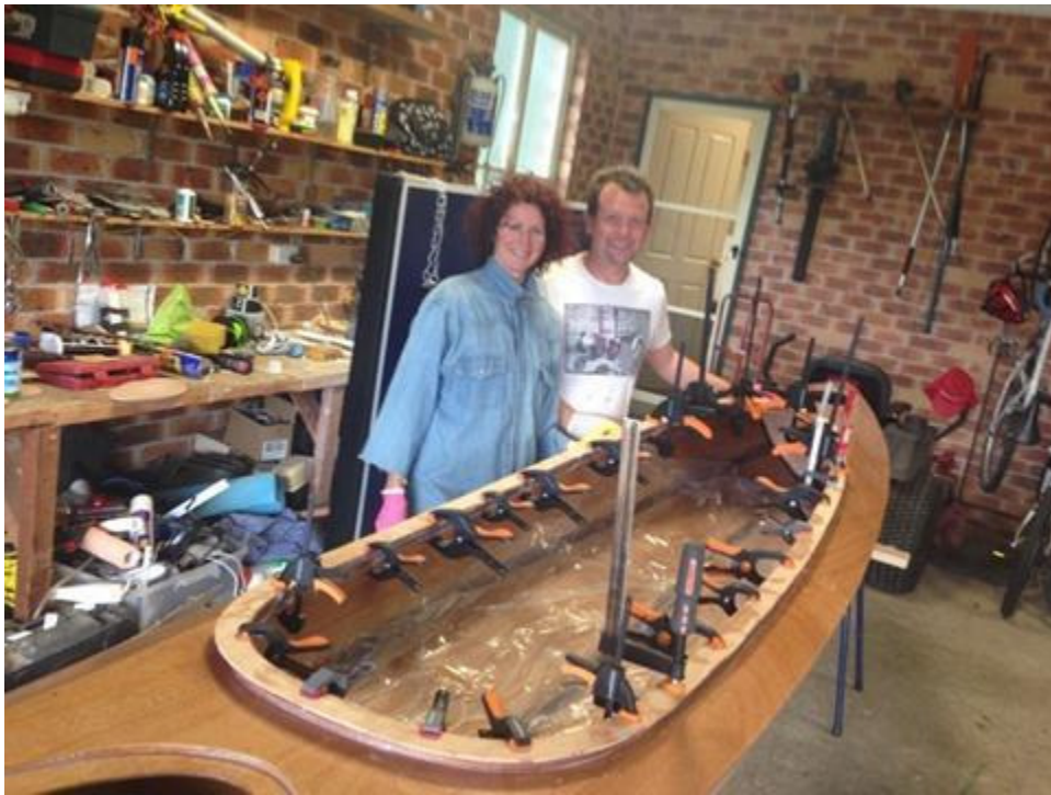
Scott's Wood Duck Double